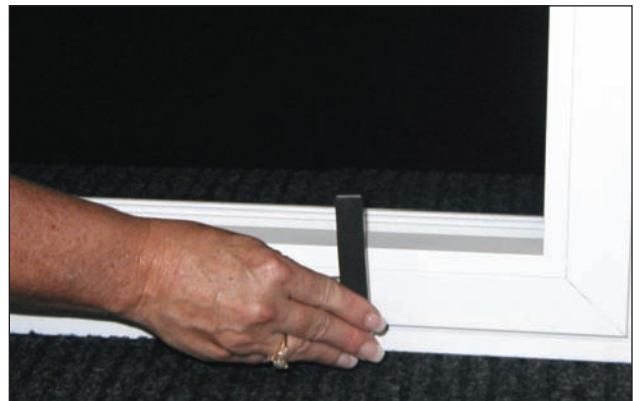
6. Insert removal rod in tamper proof screw opening to disengage safety bolt