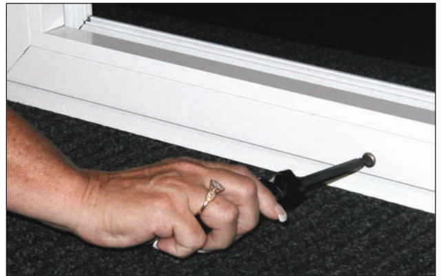
4. Remove tamper proof screw using tamper proof screw-driver