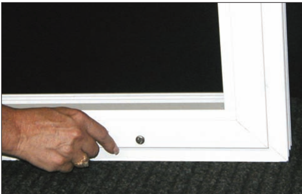
3. Tamper proof screw on bottom of window