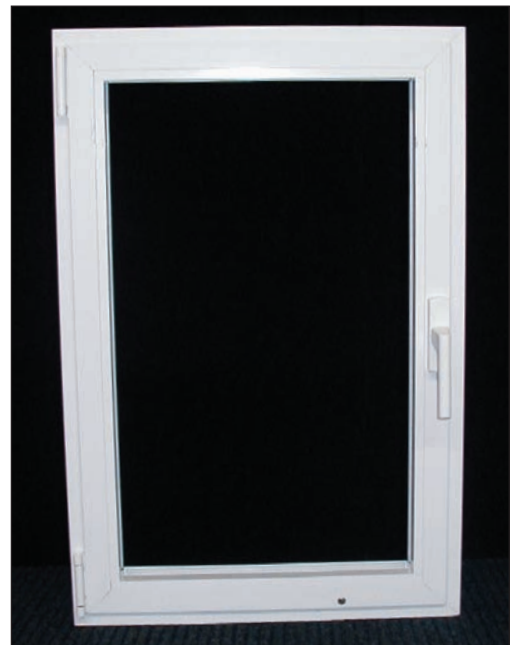
10. Closed window with tamper proof screw