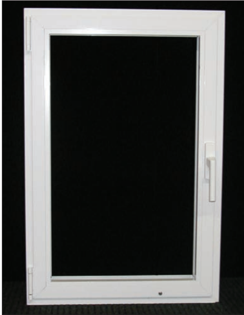
1. Window in closed position with tamper proof screw on bottom

Note: Directions are the same for side and bottom lock