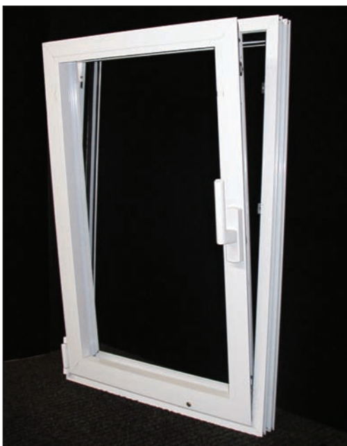
11. Tilt window in for ventilation