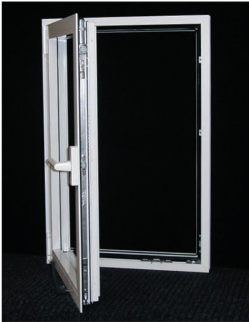
7. Swing window in for cleaning