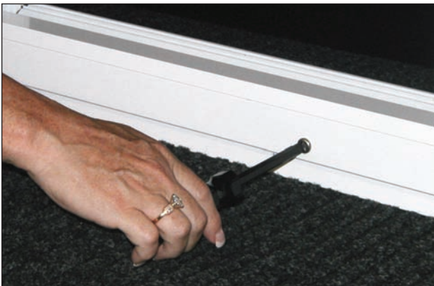
9. Re-insert tamper proof screw