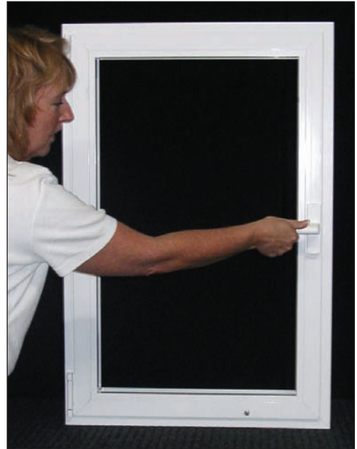
2. Position handle in horizontal mode