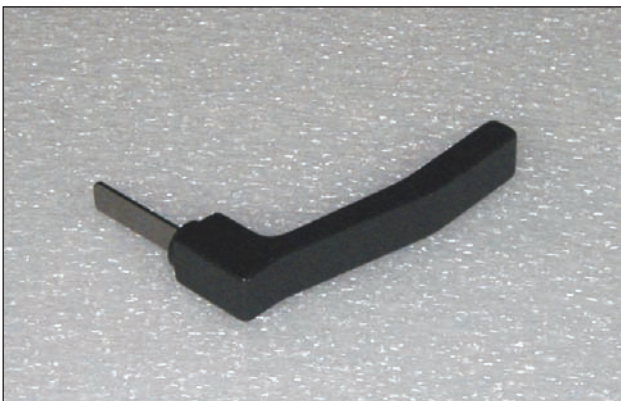
5. Removal rod (used to disengage safety bolt)